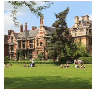
The University has 118 affiliates who have been awarded the Nobel Prize since 1904.