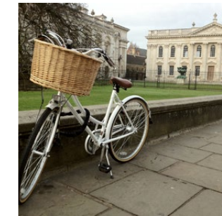
Today the University has grown to over 20,000 students, 11,000 of whom are graduate students.

The University of Cambridge has attracted many of the very best minds for over 800 years. Famous alumni of the University include the natural historian David Attenborough; the anthropologist, Jane Goodall; the novelist Zadie Smith; the engineers Ray Dolby, Charles Rolls and Charles Babbage; the scientists Hawking, Darwin and Newton; and the poets Tennyson, Wordsworth and Milton.